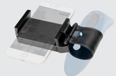
Scanner & Phone Holder